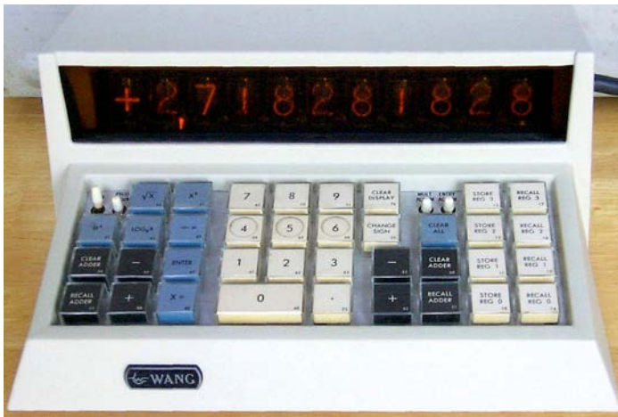
FIGURE 6. Keyboard/Display Unit of 300-Series

The 300-series was brought to market in many different versions, of which for example the 360-KT had additional trigonometric functions under dedicated keys (implemented by an internal program hard-wired in a diode matrix), and the 370/380 had added conditional branching to programs on punched card (370) or magnetic tape cartridge (380). Up to 4 keyboard units could be connected in time-sharing mode to one processor unit of the 300-series “SE” (Simultaneous Electronics). Also a series of external devices were introduced e.g., printers, tape units, core memory extensions. The much improved 300-series was a big success in the market, not in the least because the prices tumbled down from $6,700 for the first LOCI-2 in 1965, to $1,700 for a basic 300-system in 1967. The 300-series was succeeded in 1970 by Wang’s new 700-series as direct response to the release of the innovative HP-9100A by competitor Hewlett Packard. The Wang 700 still used the successive approximation method, but only to calculate pure logarithms and anti-logarithms; its multiply/divide operations now used conventional repeated additions/subtractions.