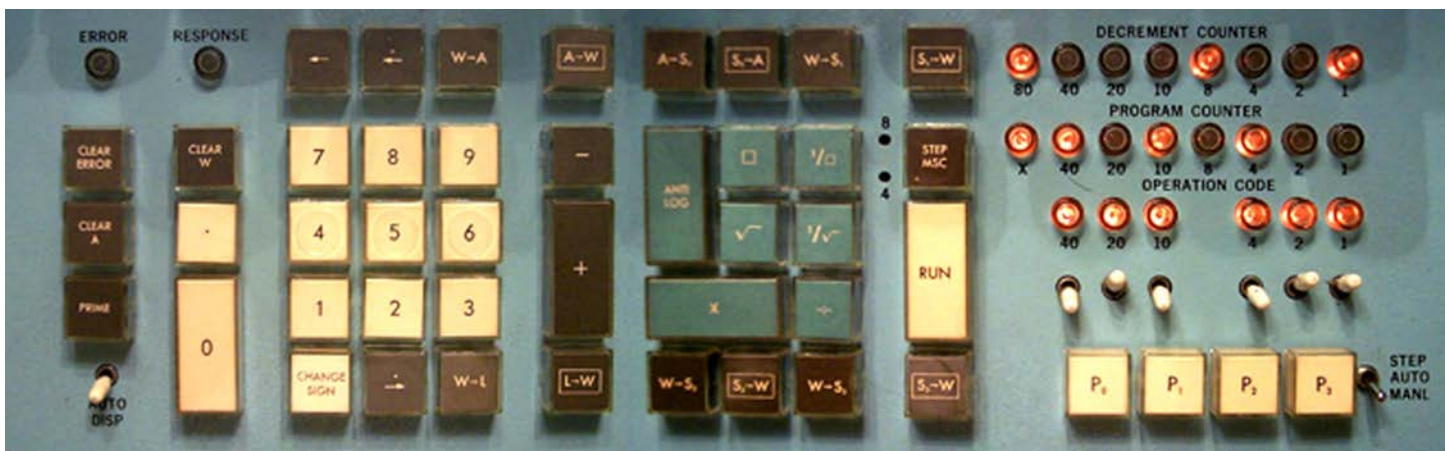
FIGURE 4. LOCI-2 Keyboard

Every approximation factor has an add/subtract compo-