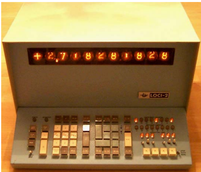
FIGURE 3. Wang's LOCI-2

To calculate the anti-logarithm (after having added or subtracted logarithmic values) the same circuits are used with small changes in control.