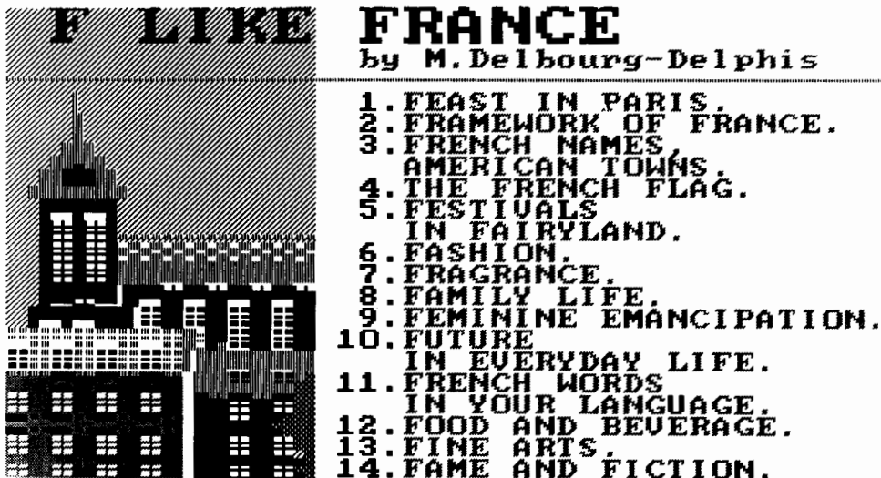
Figure 3. Example of Teletel Mosaic Graphics Screen on Honeywell Videotex System.

But the directory was not the only service available. The DGT was wise enough to encourage a wide number of private firms to establish information services by setting up a simple billing mechanism for private information services called Kiosque , making approval for Kiosque services relatively easy, by subsidizing the establishment of new services by providing assistance for videotex programming, etc. As of the end of 1984 there were already 1,000 data bases available through the systems. Roughly 700 of these were for professional use; the remainder were for residential or private uses. By the end of April 1986, there were 1,900 data bases on line. Kiosque revenues increased from about 10 million francs (about US$1.3 million) in January-February 1985 to over